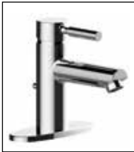
WITH ESCUTCHEON PLATE