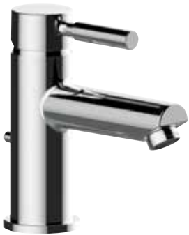
WITHOUT ESCUTCHEON PLATE